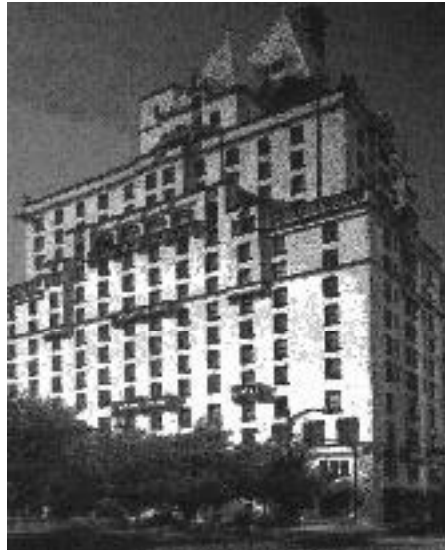
Fairmont Hotel Vancouver

The Fairmont Hotel Vancouver, a dedicated heritage building and city landmark, located in the heart of Vancouver’s thriving business, cultural and shopping centers, will be the conference site. It is also located close to