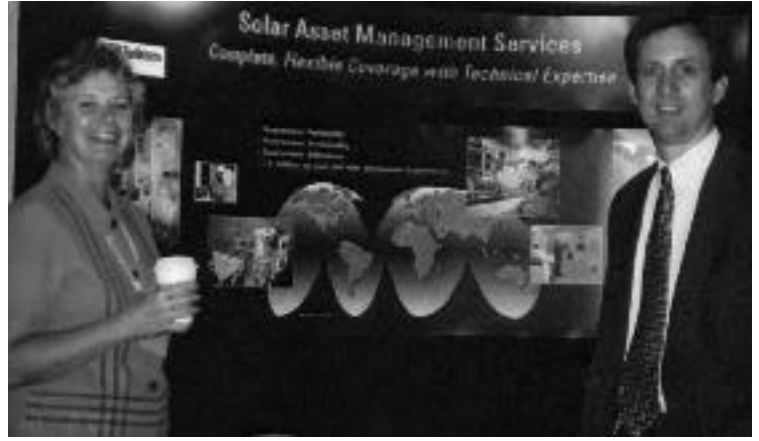
Business Partners at Solar Asset Management Services

This category was awarded to three individuals who have been active members for five years and performed a task or service on behalf of the membership that was beneficial to PCAPPA in furthering physical plant department operations and service to colleges and universities, or have actively participated in the