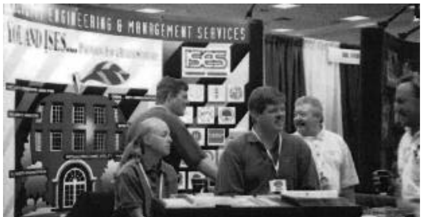
ISES Business Partners