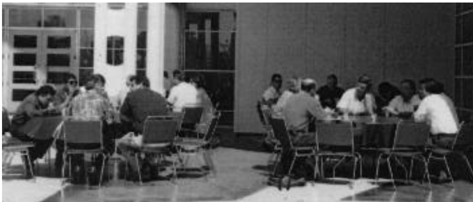
Taking a well-deserved break in front of the Convention Center

a bit better each time we meet. We need to look at our past, reassess our views and quickly adjust to the changes that will make a difference. The educational topics, facilities, location, and presenters are all areas that impact us when deciding whether or not to attend a conference. In the case of the 49th PCAPPA Conference, these factors were the major contributors to the