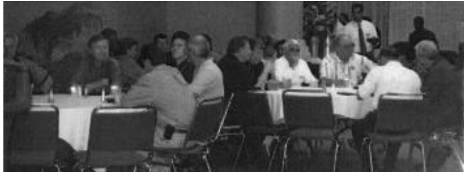
Networking over a bite

Watch for information in future newsletters.